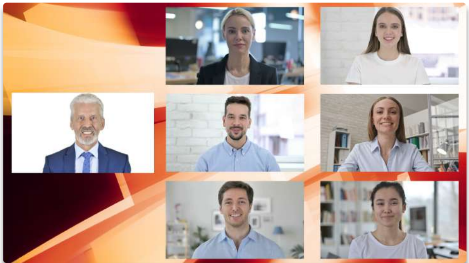
Directors can remotely “dial-in” with a URL and camera-enabled IT device into the AGM/EGM