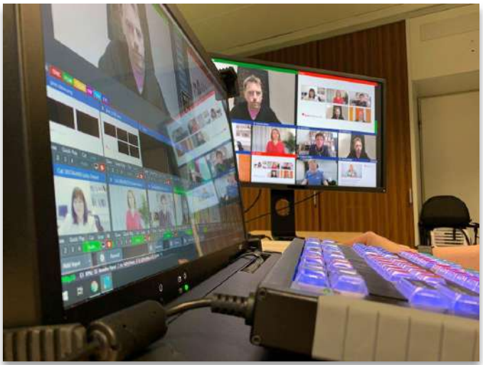
Control panel with relevant personnel at Singapore to ensure full control and support during the AGM/EGM